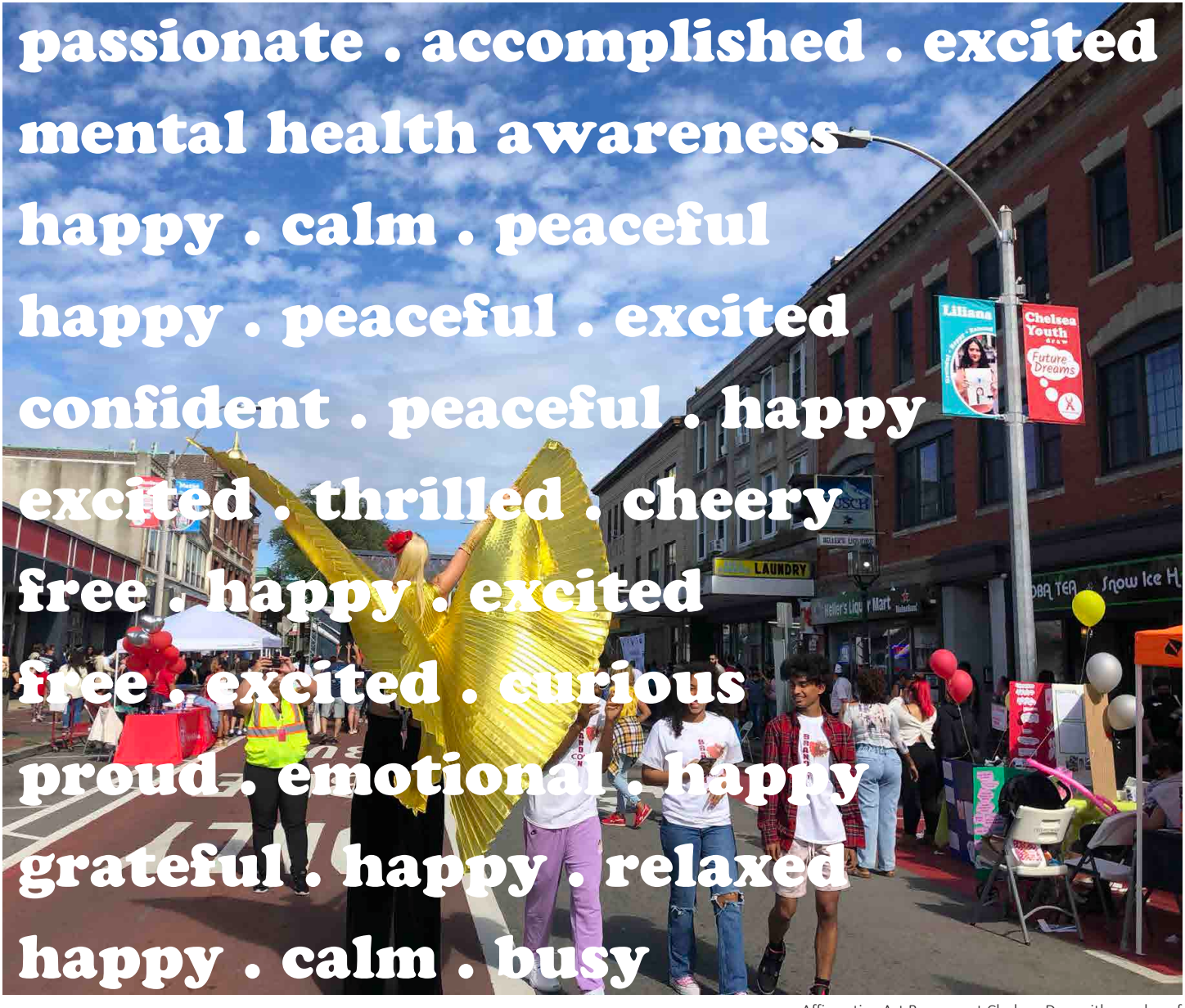
Affirmative Art Banners at Chelsea Day, with overlay of students' feelings upon achieving their future dreams.