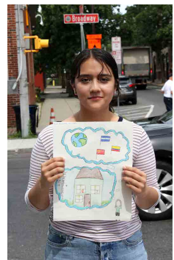
TOP AArt Workshop at Chelsea Day MIDDLE AArt Banners BOTTOM Dream Portraits